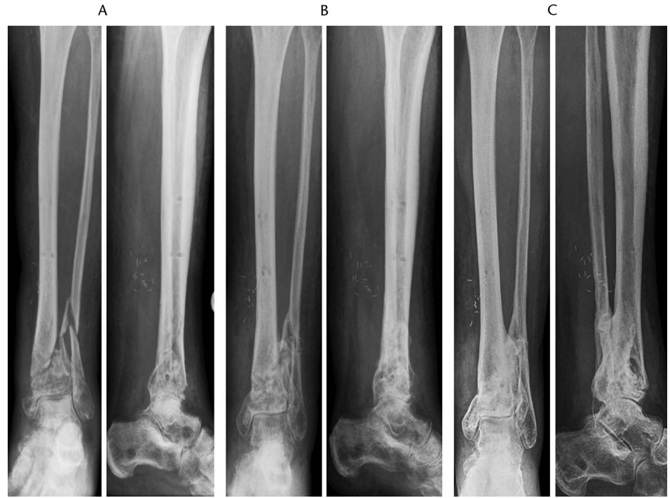
FIGURE 2. A 54-year-old diabetic woman with atrophic nonunion after a fall. Treated with one session of extracorporeal shock wave therapy and casting for 8 weeks. (A) Anterior-posterior (AP) and lateral views at 6 months. (B) AP and lateral views 3 months after treatment. (C) AP and lateral views 6 months after treatment.

were significantly associated with complete bone healing (Table 2). The significantly lower likelihood of fracture healing in patients requiring multiple (more than one) shock wave treatments versus a single treatment may be attributable to the