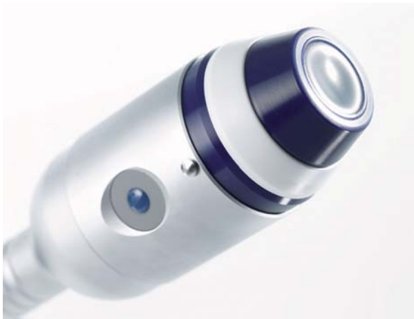
Figure 1. C-Actor handpiece of the Duolith SD1 system.

Three of these patients had received bilateral primary aesthetic augmentation with smooth implants with a volume of 200–240 ml. One patient had undergone unilateral surgery to correct breast asymmetry, while another patient with tuberous breast malformation had received bilateral surgery. In one subject, re-augmentation with smooth implants had been necessary following an infection, while another patient had previously undergone two implant replacements due to the development of capsular